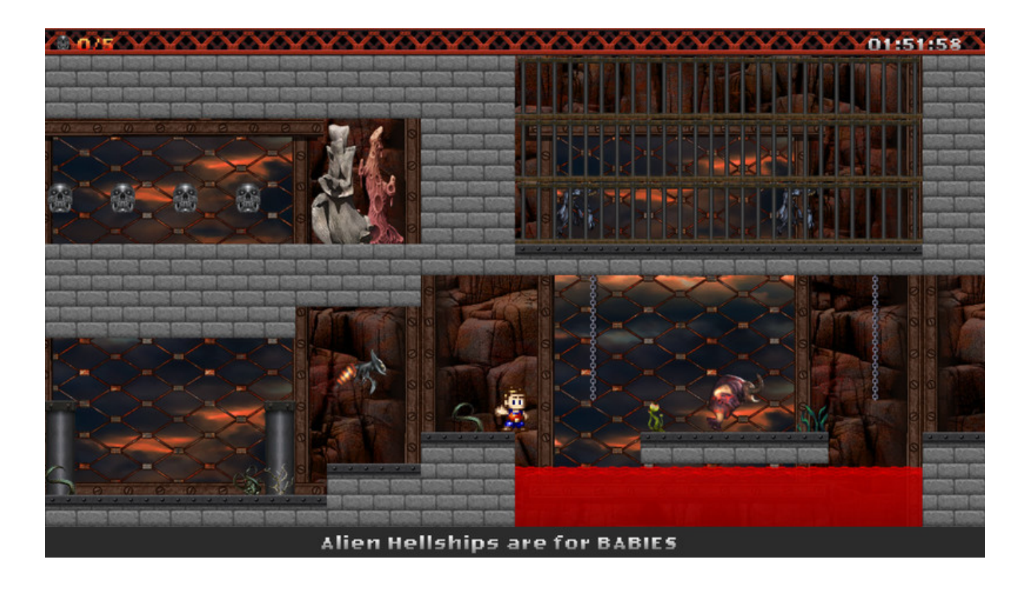
PlataGO! Super Platform Game Maker Full Crack [FULL]

Download ->>->> <a href="http://bit.ly/2SLhi8V">http://bit.ly/2SLhi8V</a>